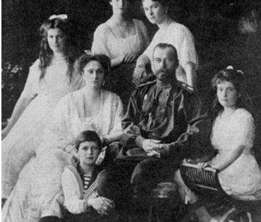
Tsar Nicholas II and his family in their days of power. At the feet of the empress is the Tsarevitch. Back row: Grand Duchesses Anastasia, Tatiana and Olga; Marie is at her father's left.