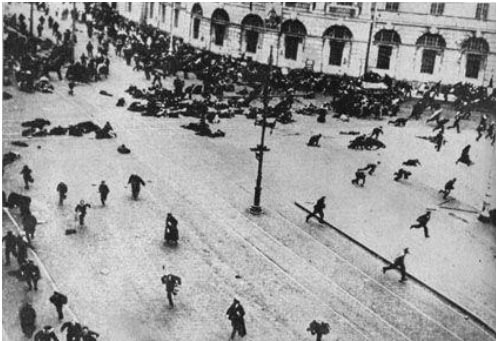
A successful attempt by the Russian Provisional Government to put down a Communist uprising in Petrograd during July, 1917. As a result of this Communist defeat, Lenin fled to save his life.

hearing the propaganda of the Bolshevik leaders as they echoed the program which Lenin had laid down in his Petrograd speech. Stalin, who was back from Siberia, wrote articles in the new Communist paper urging counterrevolution. Trotsky, who had returned from New York, used his brilliant oratory to incite the labor unions and the military forces to overthrow the Provisional Government. "Peace, Land and Bread," was the Bolshevik slogan. Under the circumstances, this propaganda was bound to have some appeal.