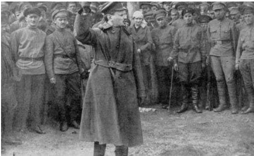
Trotsky addresses a contingent of the Red Army which he ultimately built up to a force of five million men.

During the summer of 1918, violent civil war broke out as the "White Guard" vowed they would overthrow the Reds and free the Russian people. The western Allied Nations, though hard-pressed themselves, were sympathetic to this movement and sent supplies, equipment and even what troops they could spare to help release the Russian people from the Bolshevik grip.