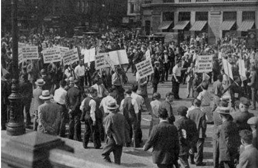
A common sight in New York during the 1930s when American Communists paraded through the streets with their familiar slogan: "Defend the Soviet Union."

Many such statements over a period of years placed Stalin on notice that if the United States were to recognize Russia, it would require many changes in Communist policies and Communist tactics. Therefore, early in 1933, when Stalin sent his old comrade in arms, Maxim Litvinov, to Washington to negotiate for U.S. recognition, he knew what the terms would have to be. In written statements, Litvinov promised that henceforth the USSR would not attempt to interfere in the internal affairs of the United States; he said the USSR would not allow its officials to use propaganda or agitate for the overthrow of the United States Government, and furthermore, he promised that the USSR would not permit any group to organize in Russia for the purpose of agitating for the overthrow of the United States Government.