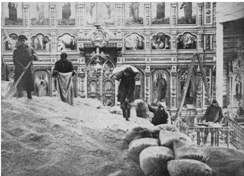
Bolsheviks use a confiscated church for a wheat granary. This was part of the Red campaign to discourage religious worship.