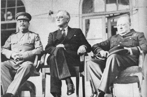
One of the meetings of Premier Stalin, President Roosevelt and Prime Minister Churchill.

This one was held at Teheran during one of the most critical periods of World War II.