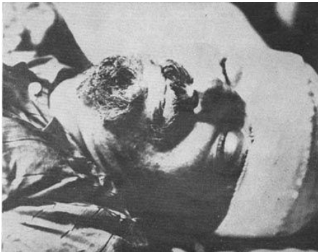
Trotsky was purged from the Russian government by Stalin

Time proved that Lenin knew whereof he spoke. Stalin's whole attitude toward life may be caught in a statement which he later made as he was rising to power: "To choose one's victim, to prepare one's plans minutely, to stake an implacable vengeance, and then go to bed ... there is nothing sweeter in the world."