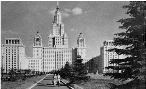
Moscow University -- where education is often used as a political tool and professors are among the best paid people in the U.S.S.R.

Vyshinsky: "The task of justice in the USSR is to assure the precise and unswerving fulfillment of Soviet laws by all the institutions, organizations, officials and citizens of the USSR. This the court accomplishes by destroying without pity all the foes of the people in whatever form they manifest their criminal encroachments upon socialism." 87