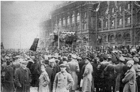
First Russian photo of the Bolshevik revolution to reach the United States. This shows victorious Communist leaders addressing a large crowd in Moscow after seizure of power.

writers call "the ten days that shook the world."