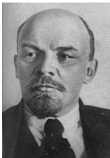
Nikolai Lenin. first Communist dictator: "Marxists have never

In 1870, Nikolai Lenin was born, and in the year 1879, there arrived on earth both Joseph Stalin and Leon Trotsky. Others would come, but these three were to be the principal leaders in carrying forward the traditions of Bakunin and at the same time doing for Marx what he was never able to do for himself; these three would convulse a great nation in a revolution and would serve as midwives at the birth of the world's first Communist dictatorship.