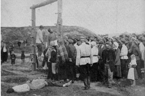
White Russians retaliate by hanging suspected Bolsheviks. During the Civil War several million lost their lives.