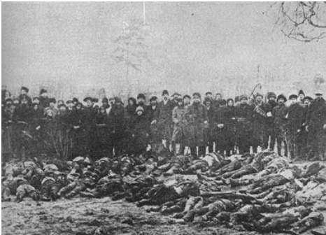
Bolshevik atrocities. Fifty bodies of community leaders of Wesenburg are exhumed from a lake after being shot and mutilated in reprisal for the death of two Communists.

the Russian economy brought down upon the heads of the people all the wrath and frustration of the Bolshevik leaders. Every terror method known was used to force the people to produce. This led to retaliation.